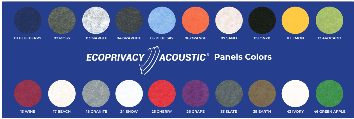
EcoPrivacy Acoustic® / Creo / Weave / Sand